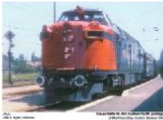
Road testing in Bavaria

BRUTE STRENGTH! That's what both the Rio Grande and the Southern Pacific were looking for in the early 1960s. The GRande and the SP found it in Europe in form of the Krauss-Maffei ML4000. The 4,000-hp ML4000 was powered by high-revving Maybach diesel engines, driving one axle in each truck through torque-converter hydraulic transmissions. All axles on the truck were geared together, in theory reducing wheel slippage. In practice, the Grande found too much slippage for their mountain grades, and sold their units to the SP.