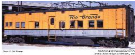
D&RWG #10 Dynamometer Car