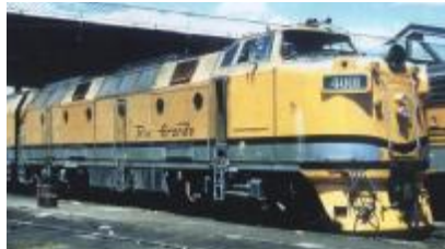
D&RGW #4001 as-delivered at Burnham

As usual, the Division Point will offer a limited number of these interesting units. Expect the usual smooth running and attention to detail. Also offered will be the Rio Grande's dynamometer car #10, which kept regular company with the K-Ms.