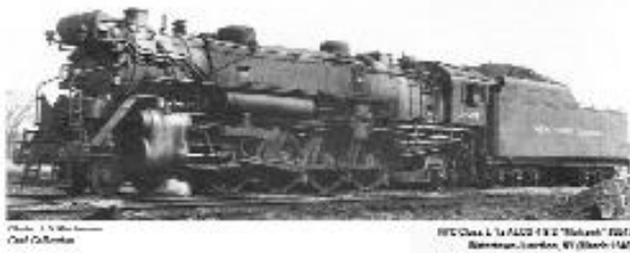
NYC Class L-1a #2512 (Alco)