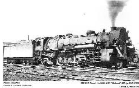
P&E Class L-1c #52 (Lima)